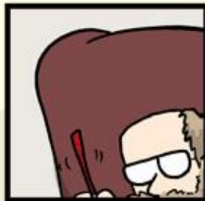
FINAL_rev.22.comments49. corrections.10.#@$%WHYDID ICOMETOGRADSCHOOL????.doc